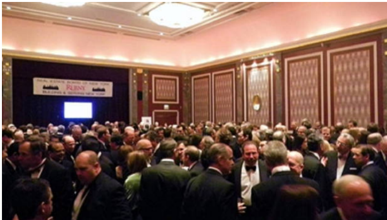
This was the crush at the elite VIP party with the Board of Governors and honorees.